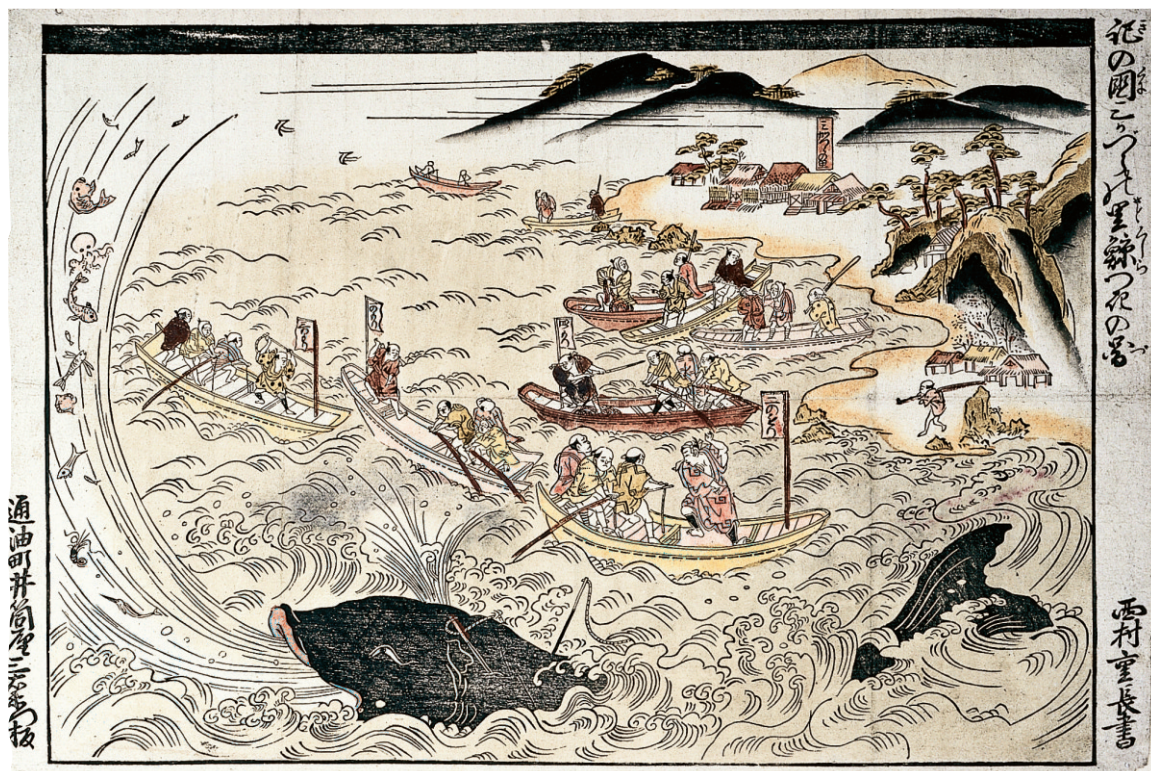
Fig. 2 Shigenaga (1697-1756), Picture of Harpooning a Whale at Mikazuki in Kinokuni (Wakayama Prefecture). Oban woodblock print, circa 1725-35. 33 x 45.7 cm.

Despite its vaguely “realistic” appearance, this early depiction of Japanese whaling is largely symbolic, and refers to an imaginary community on the crescent-shaped coast of Wakayama Prefecture, where regularized whaling and net whaling originated a century earlier.