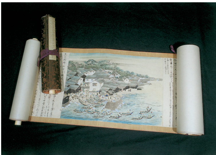
Fig. 1 Japanese emaki whaling scroll. Watercolor and ink on mulberry paper. Anonymous, 2 vols., circa 1829. Length 14.17 m and 10.21 m. [Kendall Collection, New Bedford Whaling Museum, O-344.]

Traditional hand-whaling in Japan was a community enterprise that typically occupied entire villages. Beginning as early as the first quarter of the eighteenth century, local feudal lords occasionally commissioned manuscript scrolls chronicling the whale hunt in words and pictures. These were customarily produced in several copies and circulated privately among the nobility. Some of these scrolls measure as much as 14 meters in length and are encyclopedic in scope, with step-by-step descriptions of whaling methods, anatomical elevations and internal organs of various whale species, and detailed drawings of whaleboats, gear, shore factories, topography, and ceremonial activities. The Isana-tori Ekotoba , which may be translated as “Pictorial Explanation of Whaling,” or simply “Whaling Illustrated,” is a folded book by Oyamada Tomokiyo [Yamada Yosei] (1783-1847), written in 1829, profusely illustrated with monochrome woodblock prints, and published privately in two volumes at Edo (Tokyo) in 1832. It is the great, encyclopedic, watershed classic of Japanese shore whaling, the heir to and culmination of a century of emaki scrolls. This particular scroll is a manuscript version of Isana-tori Ekotoba .