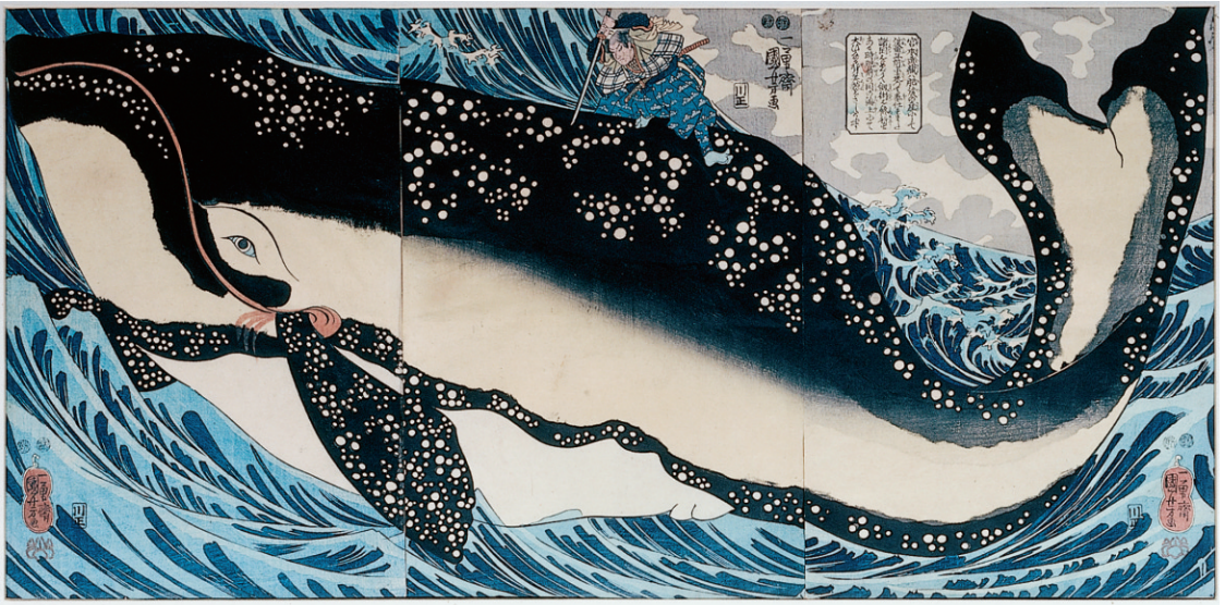
Fig. 7 Kuniyoshi. [ Miyamoto Musashi and the Whale .] Woodblock triptych, circa 1848-52. 36.6 x 75 cm. [Kendall Collection, New Bedford Whaling Museum, P-J 3106-A.] [See Appendix III]

The warrior and the whale are gloriously realized, but Kuniyoshi errs in one particular. In the inscription he refers to the adventurer having slain a sebi-kujira (right whale), but the picture is of a zato-kijira (humpback).