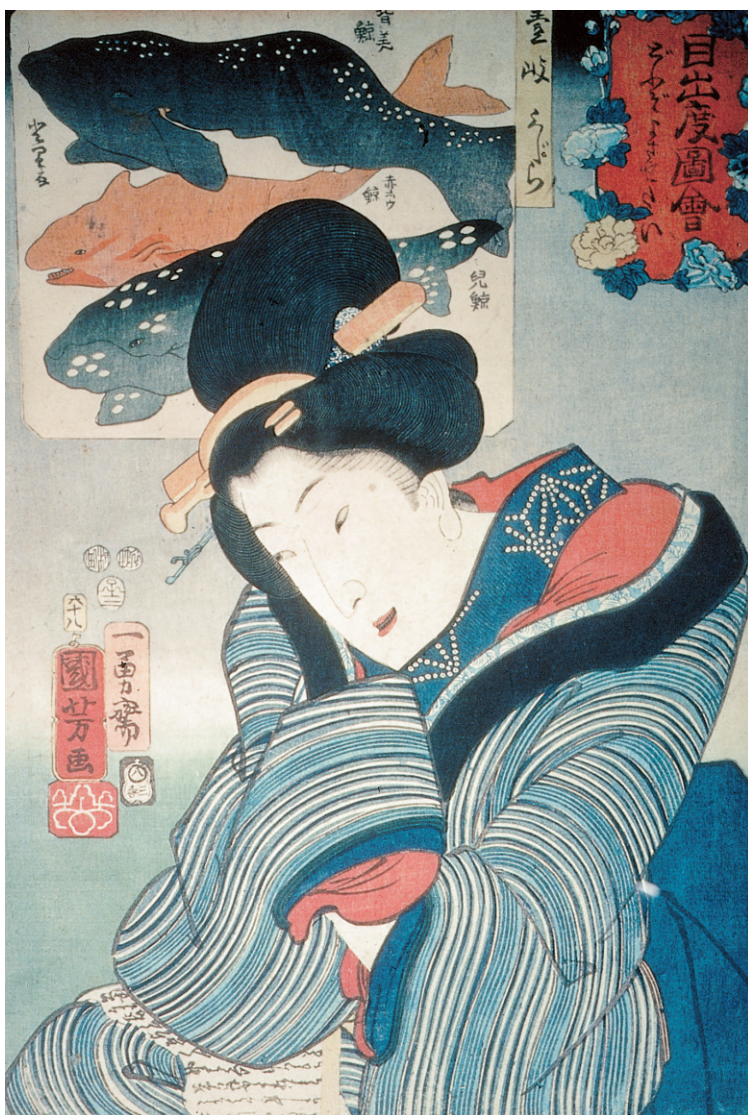
Fig. 8 Kuniyoshi, Whale of Iki Province. Oban woodblock print, from a series of “Happy Occasion Pictures,” 1852. 35.9 x 25.1 cm. [Kendall Collection, New Bedford Whaling Museum, P-J 3118-A.]

This print exemplifies Kuniyoshi's characteristic humor and subtle irony. An inscription next to the wall-hanging in the background specifies Iki-kujira (“whales of Iki Province”), which is a pun in Japanese, as iki also means “fashionable” or “chic,” apparently in reference to the woman. This is also a pun in alluding to the phrase iki no ii , meaning “high spirited,” which reflects on both the whale and the woman. Additionally, the character tai , meaning “I wish you happiness,” reinforces the central theme of a “happy occasion”; and in this explicit fisheries context it also implies another meaning of the same character: tai , a kind of fish, called in English red snapper, which, perhaps because of its name in Japanese, is customarily served at happy occasions in Japan. Yet the whole is cast under the ironic shadow of the apparent unhappiness of the subject: she meditates on a letter from her lover which implies his imminent departure, possibly with another woman (an old catalogue entry in the Forbes Collection at the MIT Museum describes the image as “A woman reading a letter, presumably from her lover to another woman”). The inscriptions express her “fervent wish to stop him” and her “wish that he would come.” A successful whale hunt – epitomized in the labeled drawings of whales hanging behind her – is the only truly “happy occasion” in this otherwise melancholy portrait.