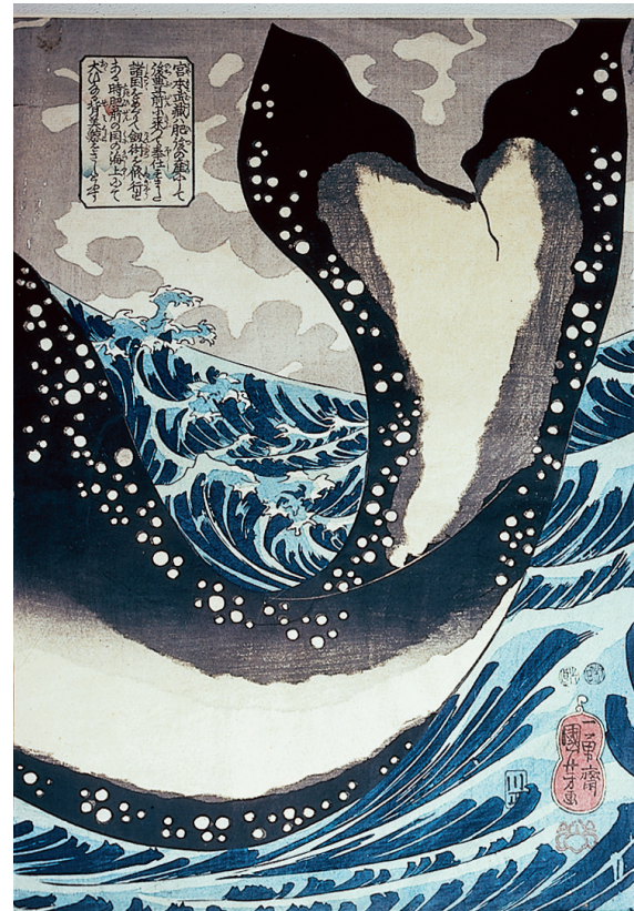
Appendix III: Fig. 7 Kuniyoshi, [ Miyamoto Musashi and the Whale ], circa 1848-52