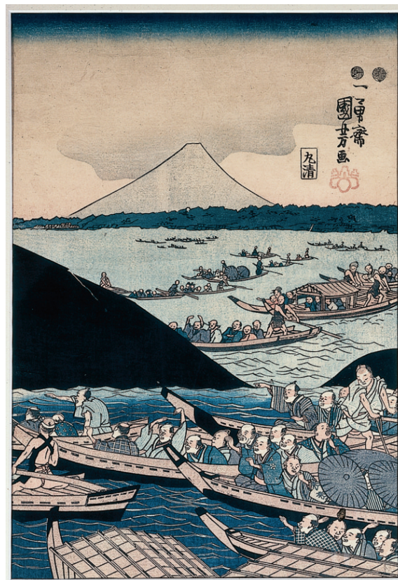
Appendix II: Fig. 5 Kuniyoshi, A Big Whale Catch Makes for Prosperity , circa 1847-52