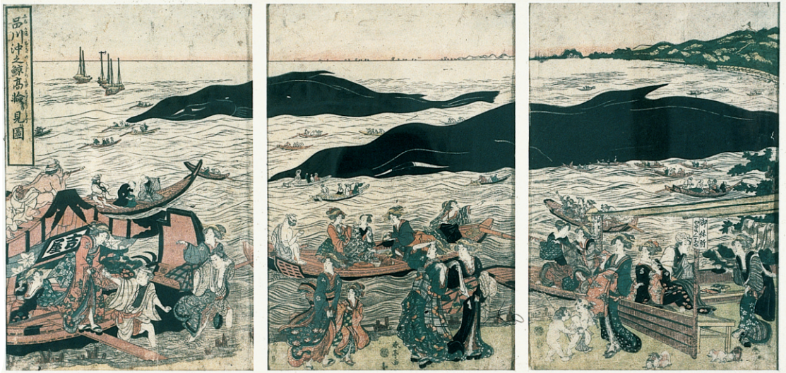
Fig. 3 Shuntei (1770-1820), Seeing the Whale in Shinagawa Bay at Takanawa . Woodblock triptych, 1798.

38.7 x 80 cm. [Kendall Collection, New Bedford Whaling Museum, P-J 3122-A.] [See Appendix I]