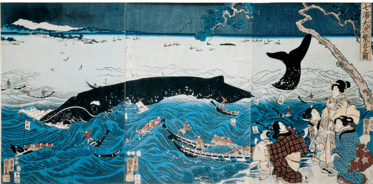
Fig. 6 Kuniyoshi, Seven Shores (Villages) Made Prosperous by a Whale Catch . Woodblock triptych, undated. 34.3 x 71.1 cm. [Collection of the MIT Museum, Cambridge, Massachusetts USA, XJ-91.]

Complexity of subtext, subtlety of the clues, a certain whimsical charm, and nonconforming originality are qualities that pervade much of Kuniyoshi’s work and are especially visible in his “Shiojiri” print from a series entitled “Sixty-Nine Stations of the Kisokaido (Kiso Highway),”