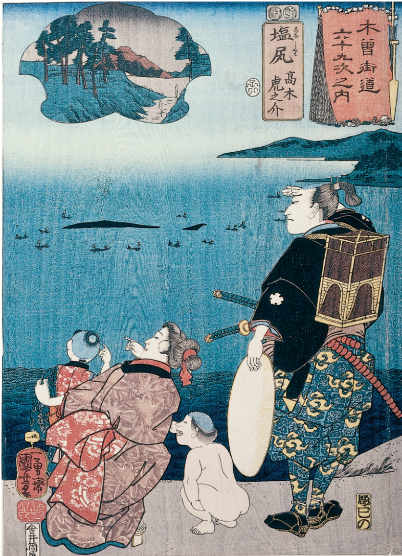
Fig. 9 Kuniyoshi, Takagi Toranosuke Viewing the Capture of a Whale . Oban woodblock print, from a series entitled "Sixty-Nine Stations of the Kisokaido (Kiso Highway)," 1852. 34.3 x 24.8 cm. [Kendall Collection, New Bedford Whaling Museum, P-J 3114-A.]

This is one of Kuniyoshi's most complex prints, but not necessarily one of his most enigmatic: clues to its subtle humor and possible secondary meanings abound. On the surface it is mere travelogue, part of a standard series of authorized views that attracted a host of ukiyo-e artists. But in Kuniyoshi's hands the convention is turned on its head, and it becomes a reverie of inner landscape.